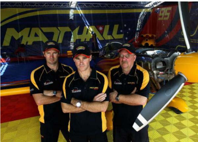
Aircraft Bouncers!! What a motley crew!