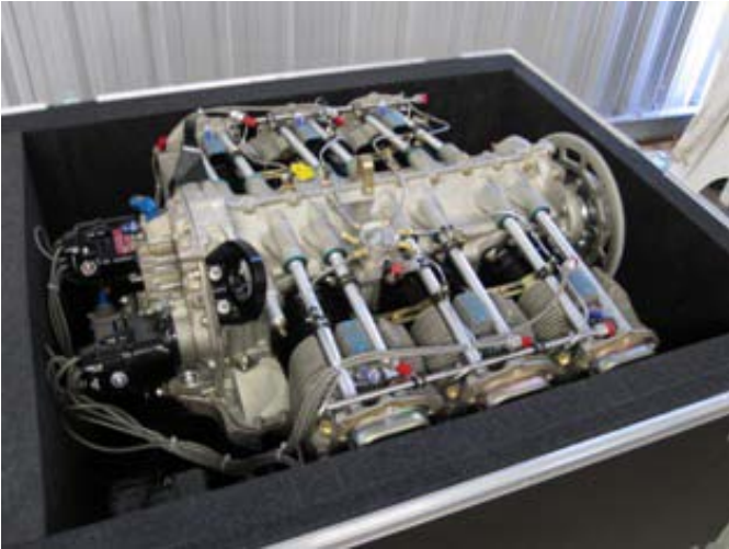
The new engine before it even left the box

Check out our Happy Snaps section each edition for photos you might not see anywhere else (not if we can help it anyway!).