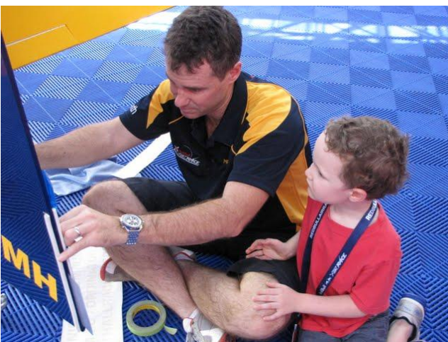
Father and son apply stickers to the aircraft

The schedule in the hangar is very meticulous and important to a successful day – as is this message that was on it from Day 1 in Abu Dhabi!