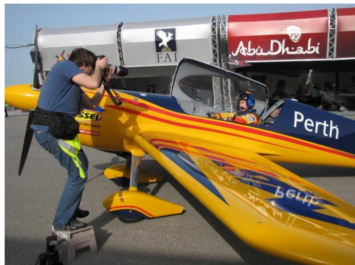
One of the many photo shoots a pilot is involved with in race week